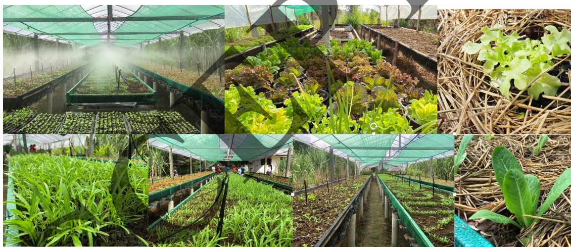
Figure 2 Farms that Employ Intelligent Agricultural Technologies