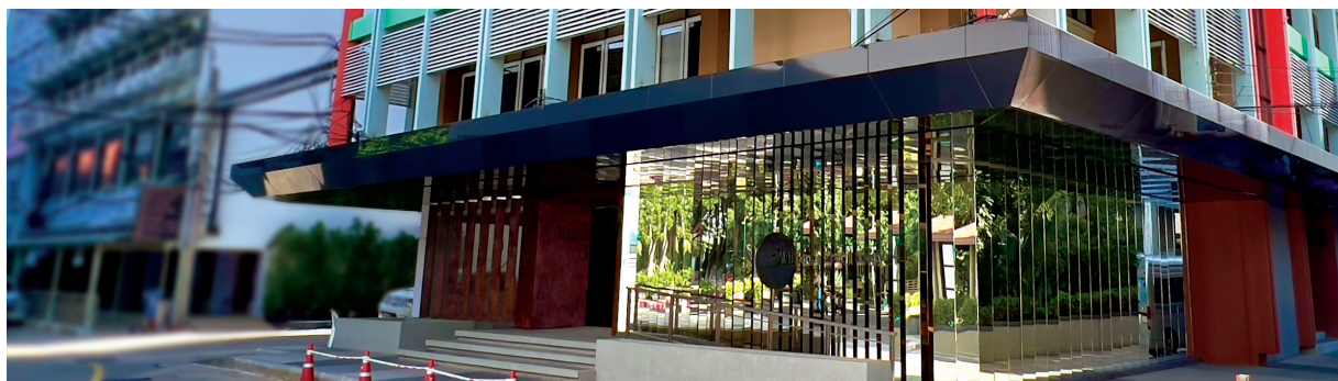
Figure 2 One World Library, Suan Dusit University

“Good Knowledge” is derived from experiences and creative thinking. Therefore, place-based learning is one concept of learning that fulfills the acquisition of knowledge as well as continuity. For instance, learning