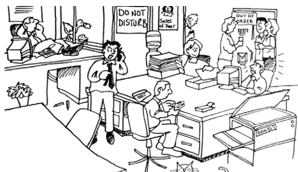
Figure 2 An unorganized and chaotic office

confidence to eliminate fear of making errors were a priority that the teacher should consider in order to make the learners feel comfortable with their language use.