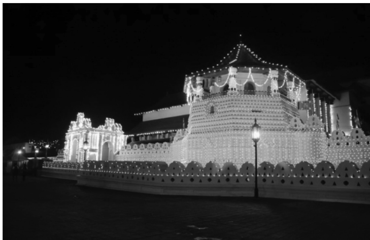
Figure 2 The Temple of the Tooth, Kandy, Sri Lanka, 2013

However, Theravada Buddhism in Sri Lanka experienced ups and downs throughout history. The Chola (a South Sub-continent based Tamil kingdom) invasion of Sri Lanka in the 10 th century brought Theravada Buddhism into darkness and during that period, the Hindu power pushed Buddhism into the margins. The number of Sanghas decreased dramatically. After Sinhala people regained power on the island, it was the Sanghas from Arakanese kingdom and the Rammana kingdom who saved the Sangha order in Sri Lanka. Then during the colonial era, when the Portuguese power first landed on this island, they considered themselves as the protector of the Holy Catholic faith and charged with propagating Catholicism around the world - this deed was approved and supported by the Holy See. When the Portuguese arrived in Sri Lanka, they gradually took control of the coastal area, and began to stop the popular practice of Buddhism by forcing monks to un-robe, destroying monasteries and preventing Buddhist activities. As a result, Buddhism was brought to a dangerous situation. This time with aid from Siam and Burma, the Sangha order was thus saved again.