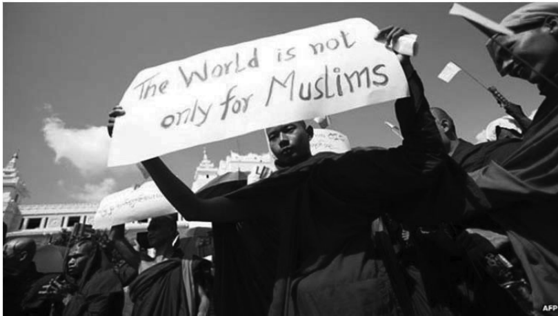
Figure 5 Myanmar Buddhist monks demonstrating in Yangon with anti-Muslim slogans.

Muslim is violence, radical, dangerous, exclusive society and fast growing population. Globally the fear of Muslim that flies around the world, not only in the Christian Western countries but also in Buddhist Sri Lanka and Myanmar.