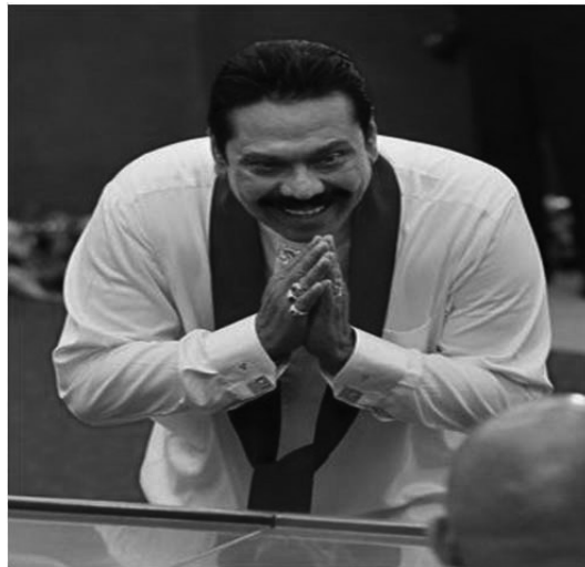
Figure 9 It is said that the former Sri Lankan president Rajapaksa had lots of connections with the Bodu Bala Sena

In a word, the twisted relationship between the government and Sangha worsens the situation. In the case of Myanmar, in 2007, ignoring the despotic power of Myanmar's military government, to the world's amazement, the monks led the Saffron Revolution against the government. Nevertheless, the author found some Sangha members chose to embrace the government after the quick opening up in 2013 and part of the Sangha has been used by the strong military power in Myanmar government for their political interests.