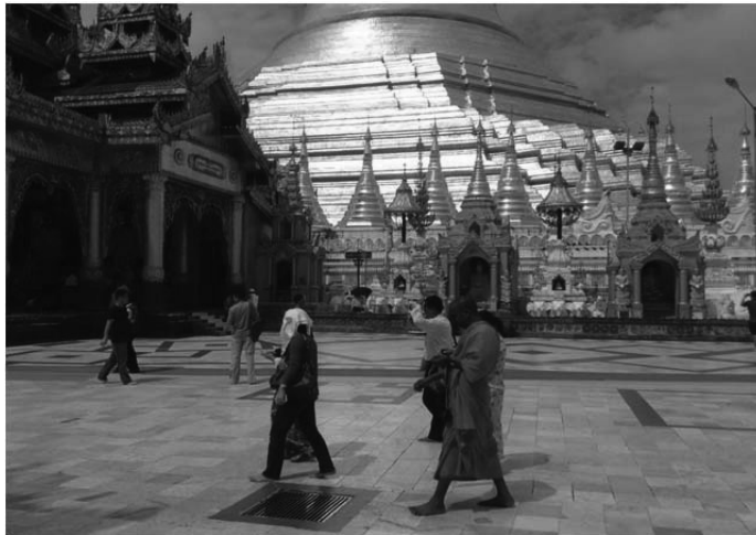
Figure 3 Shwe Dagon Pogoda in Yangon, Myanmar, 2013