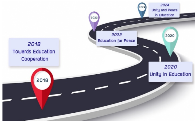
Figure 3 ASEAN Education Roadmap 2018-2024

The scenario was shown in ASEAN education roadmap to predict the future of education that to move towards education cooperation in 2018, to be a unity in education in 2020, to have education for peace in 2022, and to make ASEAN community full of unity and peace of education in 2024 as below figure.