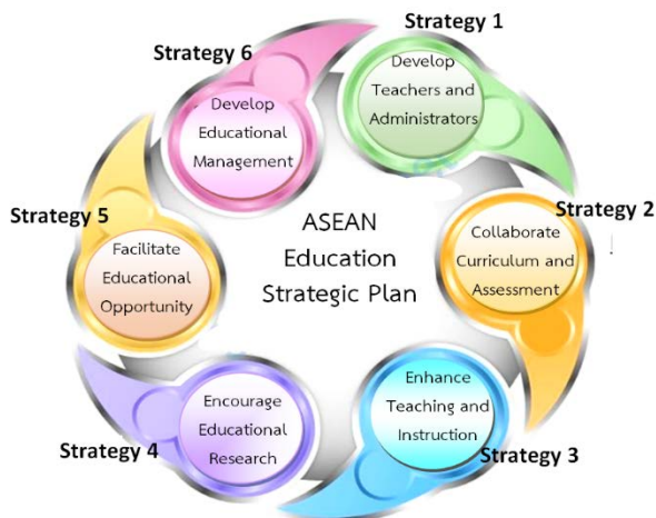
Figure 1 ASEAN Education Strategic Plan