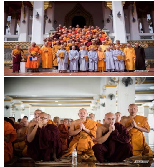
Figure 7 Students attended the activities related to Buddhist Ceremony

temple in the area around Mahachulalongkornrajavidyalaya University or temples in which that monk can communicate with each other. However, in the case that cannot speak Thai at all, most of them are at the dormitory for the reason that they cannot communicate with the abbot in Thai temples and most of them can speak Thai as well (Interview Executive B, 27 December 2017) during staying in a dormitory. Therefore, there are activities due to living together such as praying, chanting, residential development, cleaning the place. For example, there will be a cleaning day to clean the accommodation, joint housing development every week that resulting in communication and joint activities which cause a positive interaction between students inside the university dormitory.