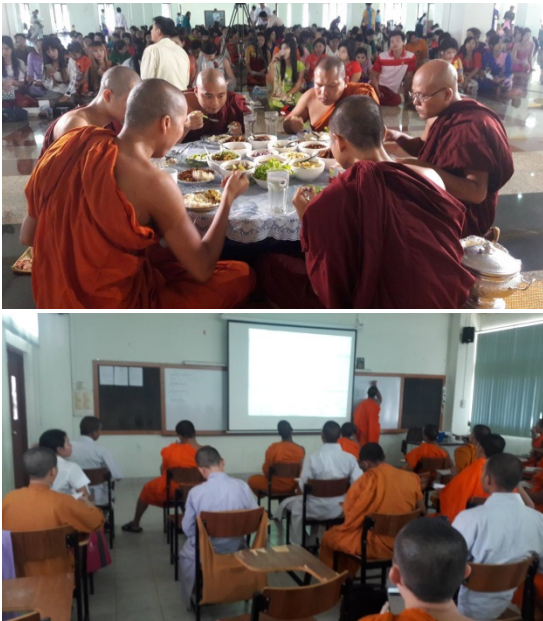
Figure 8 Students activities during they lived together within the university area that caused them learn from other differences.

4. Religious activities and coexistence activities, that is to say, most of the students are monks and novices. In the university, there are 2 main sects, Mahayana from China, Vietnam, Taiwan and Theravada from Laos, Myanmar, Vietnam, Cambodia, Thailand, Bangladesh, Sri Lanka. When they come together in the same religious culture, there are activities that follow religious principles such as Khao Phansa, Kathin, Pa Pha, or important Buddhist Day on Visakha Puja Day, or the prayer of students on this point is a religious practice. This can also leads to mutual learning on cultural differences. When it specifically goes down to Burmese students, the interaction between each other leads to the learning, acceptance, and adjustment of attitude to positive communication together including that the university has stipulated to conduct cultural demonstration activities, as in the case of orientation for new students to have knowledge about Thai culture or each other's culture, resulting in learning and understanding in each other including the students in the name of Burmese nationality participated in activities by learning to adjust positions to the historical and ethnic sense which is believed to be lighter and more positive interaction (Interview Executives D, 21 December 2017).