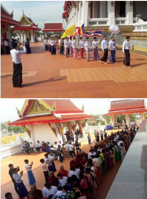
Figure 3 Identity of Buddhist Ceremony of Burmese who work and live in Thailand. They came and joined activities with Burmese at Mahachulalongkornrajavidyalaya University, Year 2017-2018

1. Burmese is the most ethnic group in the country and most of the Burmese live in the Irrawaddy River using Burmese language in their daily lives. Genetically, East Asian and Indian when specific to the Burmese students will wear the robes in the Myanmar style and use Burmese Language as the primary language. There are group activities in the name of Burmese students and it is only in Myanmar group rarely cross-ethnic interaction and can speak in Burmese and English. There is also rarely interaction between other ethnic groups that study in English programs organized by the university such as linguistics or Buddhism in international programs. When counting as a proportion of Burmese students, there will be more than 200 students within Mahachulalongkornrajavidyalaya University, Phra Nakhon Si Ayutthaya Province. There are also joining in group to do activities in the name of the Myanmar Student Club and interacting with Burmese workers who come to work in Thailand through religious ceremonies such as Kathin or Bunpa Pa, etc. (Interview Students A, 24 November 2017)