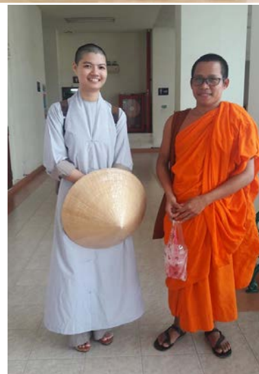
Figure 4 There are 4 monks students from 4 ethnic groups which are Burmar, Rakhine, Pa-O and Kaya from Myanmar. They are also two Vietnamese students who have different Buddhist sects.

3. Ethnic Mon is people of ancient civilization in the land of Burma Speak the language of the Mon-Khmer