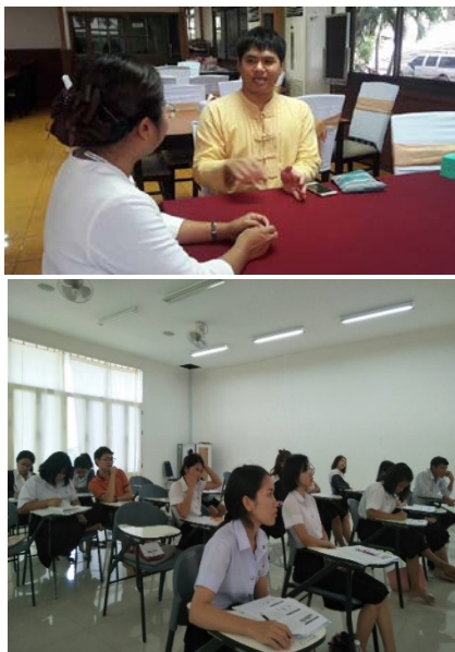
Figure 10 Interview Lecturer from Bhodhivichalaya Srinakharinwirot University,

Mae Sot District in Tak Province, on 12 th October 2017