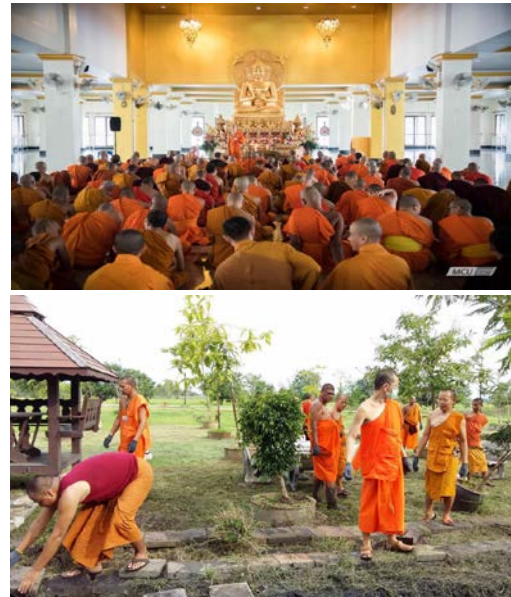
Figure 9 Students join together to do Buddhist ceremony and practice including help each other to clean and look after the area of their loving within the university.

4. Religious activities and coexistence activities, that is to say, most of the students are monks and novices. In the university, there are 2 main sects, Mahayana from China, Vietnam, Taiwan and Theravada from Laos, Myanmar, Vietnam, Cambodia, Thailand, Bangladesh, Sri Lanka. When they come together in the same religious culture, there are activities that follow religious principles such as Khao Phansa, Kathin, Pa Pha, or important Buddhist Day on Visakha Puja Day, or the prayer of students on this point is a religious practice. This can also leads to mutual learning on cultural differences. When it specifically goes down to Burmese students, the interaction between each other leads to the learning, acceptance, and adjustment of attitude to positive communication together including that the university has stipulated to conduct cultural demonstration activities, as in the case of orientation for new students to have knowledge about Thai culture or each other's culture, resulting in learning and understanding in each other including the students in the name of Burmese nationality participated in activities by learning to adjust positions to the historical and ethnic sense which is believed to be lighter and more positive interaction (Interview Executives D, 21 December 2017).