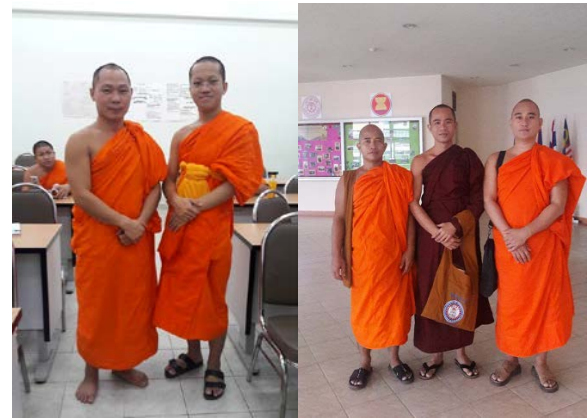
Figure 5 Burmese students live, study and do activities during studying at Buddhist University (Source: Author, 15 November 2017)

The differences of ethnic language and cultural have become important reasons for these students to have no different important characteristics. Due to the fact that those differences create different propulsion processes and identity mechanisms and can make us see that students actually appearing on a variety of ethnicities make a great difference among these students until now. It creates an overall drive towards what is happening under the mechanism of differences and alienation as seen by some students that behave differently from all Thai monks. These values, behaviors, beliefs, and ideas are markedly different.